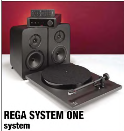
REGA SYSTEM ONE system