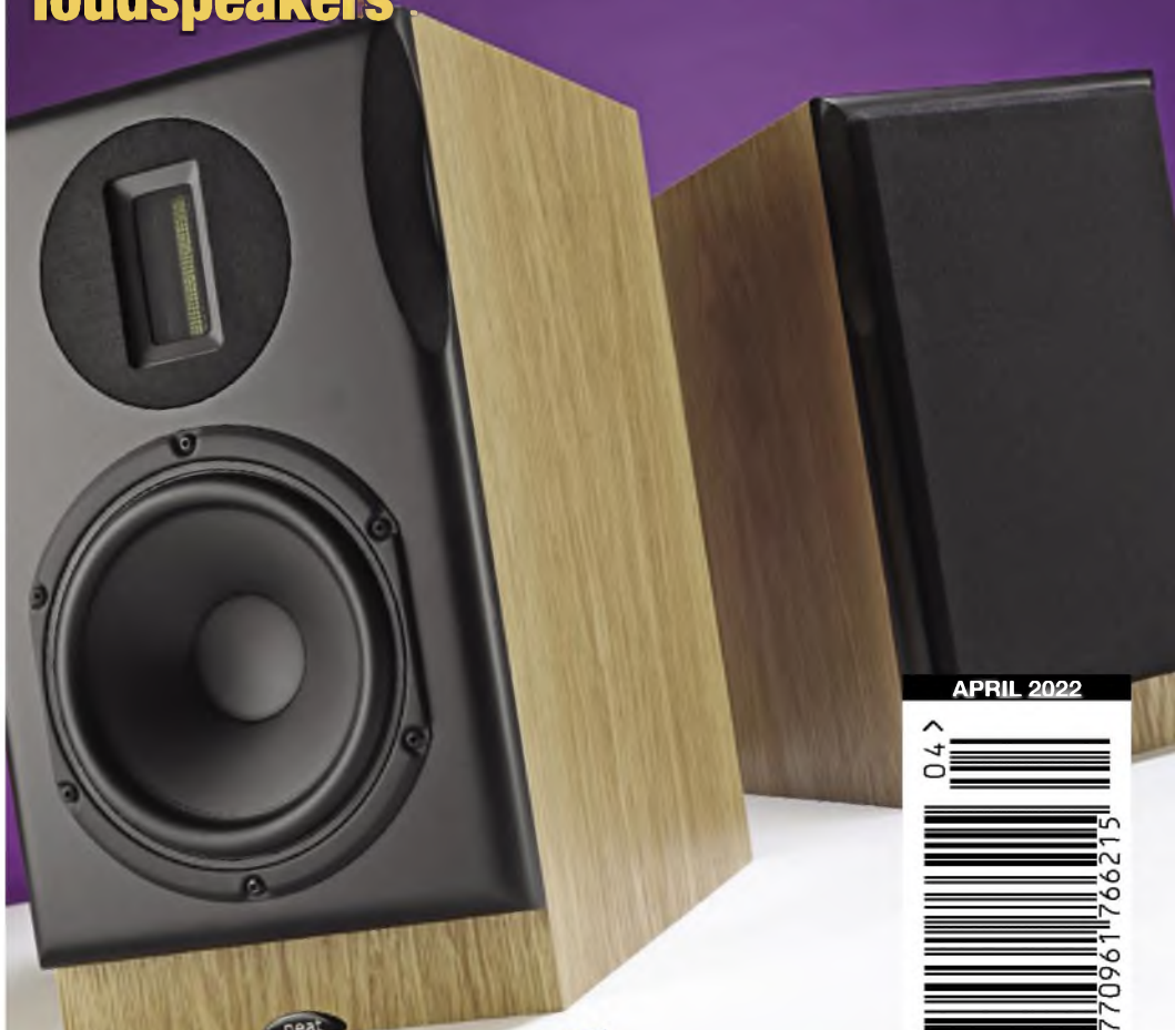
PSB M4U8 MKII HEADPHONES EXCLUSIVE