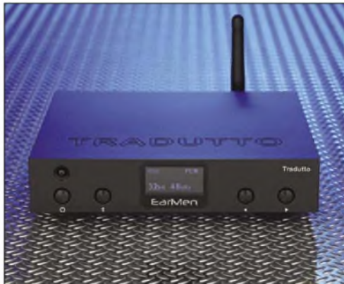
EARMEN TRADUTTO EXCLUSIVE! dac

FREE READER CLASSIFIED ADS IN THIS ISSUE!