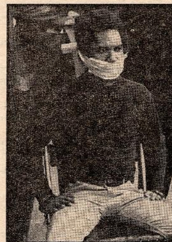
Al Freeman Jr as Bobby Seale, bound and gagged in Chicago