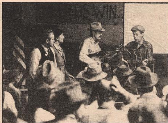
David Carradine (r) in 'Bound for Glory'

The film of Bound for Glory is a carefully crafted, richly detailed evocation of the Thirties, a time during which Guthrie bolted from his dust-choked home in Pampa, Texas (leaving behind his wife and two children), and head-