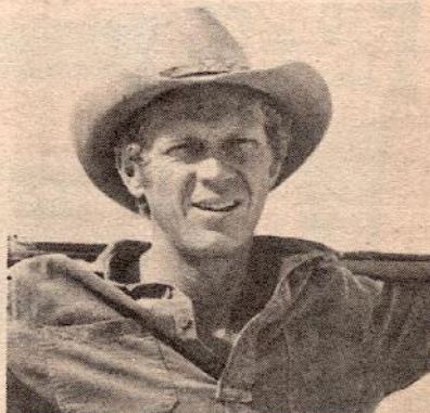
Steve McQueen in a scene from Nevada Smith

7 13 FEATURE FILM Nevada Smith (1966). Western starring Steve McQueen, Karl Malden, Arthur Kennedy, Brian Keith, Suzanne Pleshette. (2 hrs. 30 mins.) A quiet youngster develops into the West's deadliest killer.