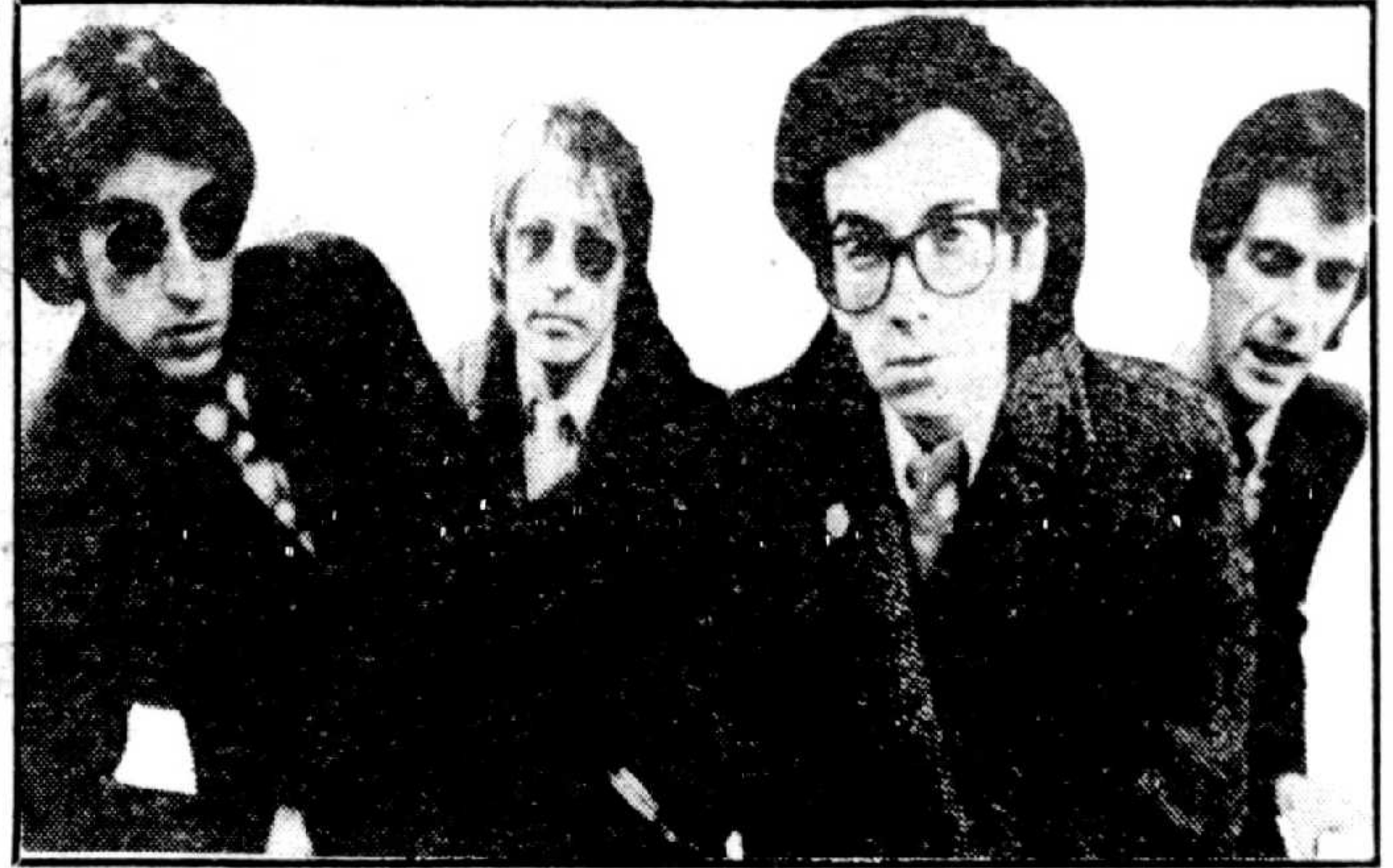
ELVIS IS BACK — Mr. Costello and the Attractions pull some wonders out of their remainder pile.