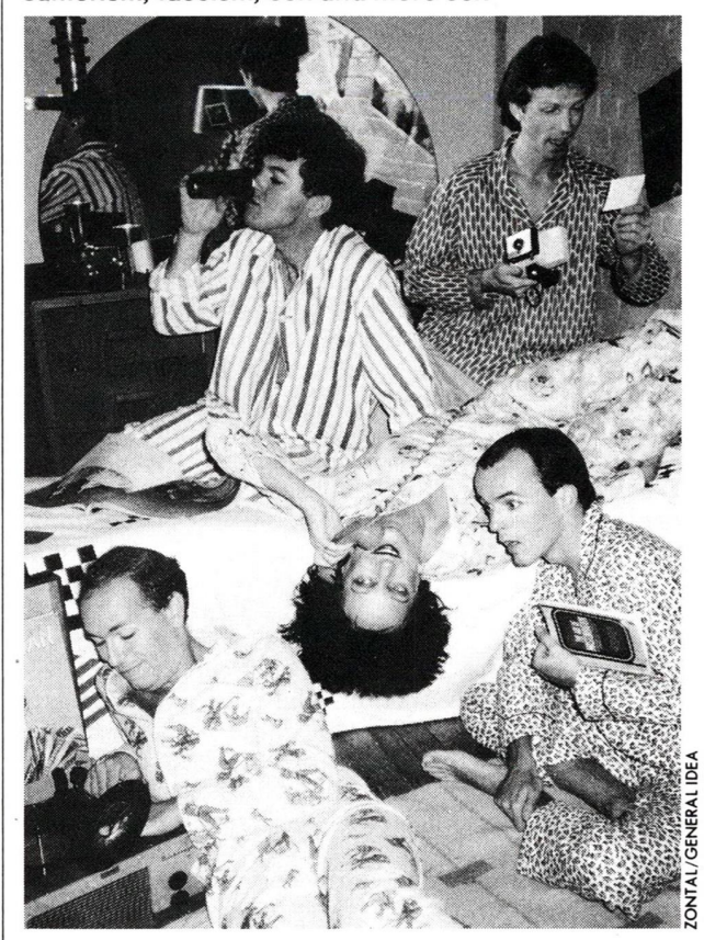
Pope and Staples with backup musicians, 1981: consumerism, fascism, sex and more sex