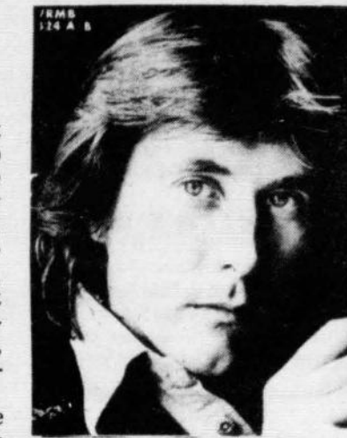
Bryan Ferry of Roxy Music.

Bryan Ferry is the only rock artist who I would not hedge to label a "genius." Among the various strains of rock visionary currently in creating order, whether it be the poet-laureate (Dylan, Simon, Mitchell, Newman), the populist schizophrenic (Lennon), the androgynous chameleon (Bowie, Reed), or the manufactured mythomonger (Springsteen, Townshend), Ferry is the only one who has created a body of work that can be appreciated for its musical cleverness, lyrical focus, and developed conceptual personality without having to be rationalized nostalgically or elegiacally.