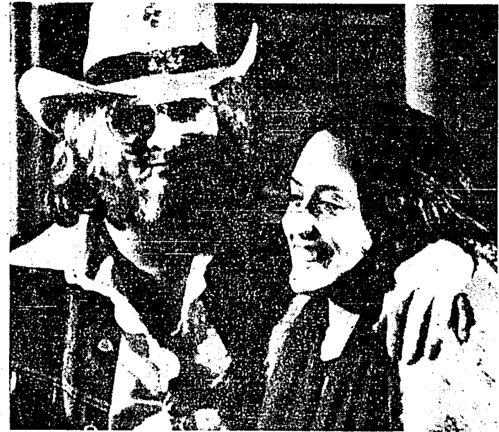
PERFORMERS Rompin' Ronnie Hawkins and Joan Baez were among hundreds of stars who attended an all-night party for Bob Dylan at Harbour Castle Hotel. It followed Dylan's appearance at Maple Leaf Gardens before 16,000 fans.