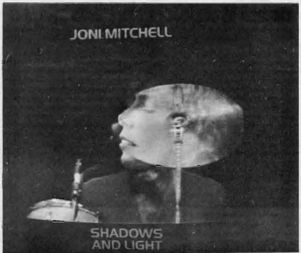
Mitchell's new album cover adorns abstract mystique