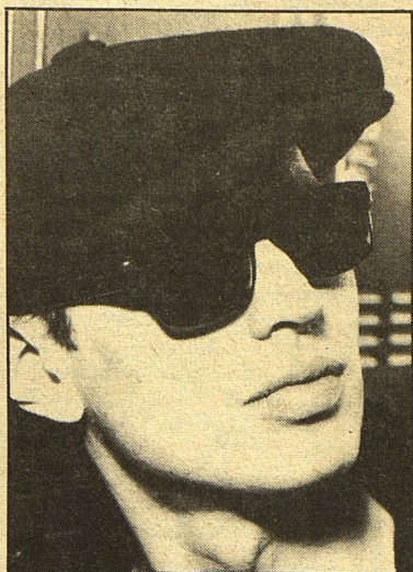
Johnny Strike of Crime

"I don't like the idea that people can't teach in the schools because they're gay," he said in disgust. "It's a starting point because it could lead to kids not watching TV and restrictions on a lot more occupations. In a logical progression it threatens me; it could get more radical