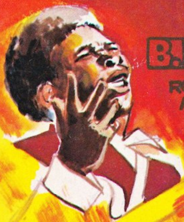
B.B. KING ROCK/BLUES MUSICIAN

Plus features on: ART PEPPER • WILBUR DUKE • SCOTT HAMILTON ...and more!