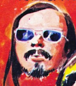
STEELY DAN ROCK/BLUES GROUP