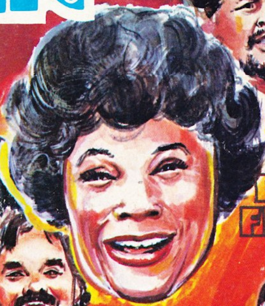
ELLA FITZGERALD HALL OF FAME