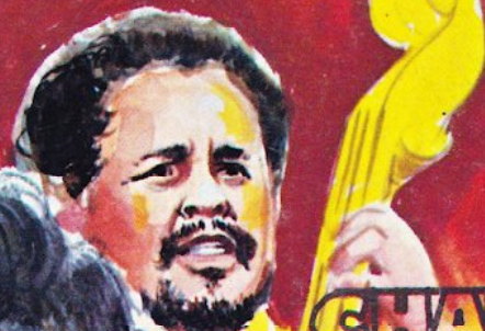
CHARLIE MINGUS JAZZ MUSICIAN