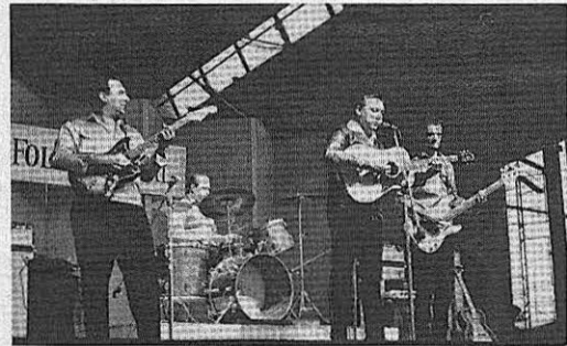
Dave Dudley and his Roadrunners provided the country music side with "Six Days on the Road."