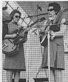
Mother Maybelle Carter joins Sara for first public performance together in more than two decades.