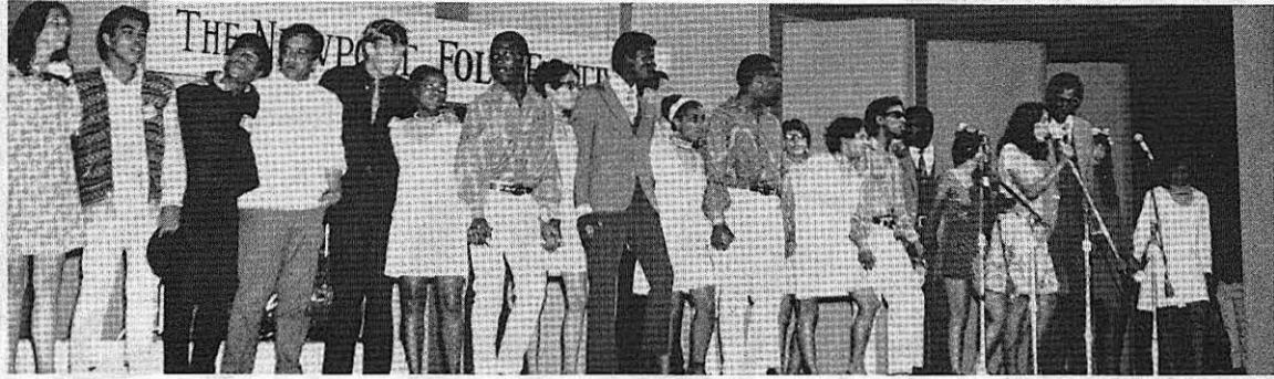
The finale Friday night brought everybody out to sing "We Shall Overcome."