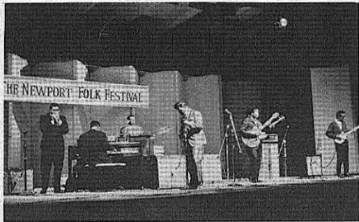
Muddy Waters and his blues band and his bottleneck style guitar playing.