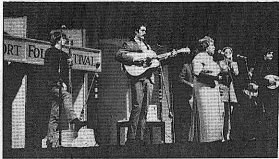
The Jim Kweskin Jug Band backs Sippie Wallace in old blues tunes.