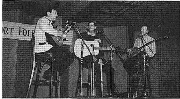
Three folk singers—from left, Theodore Bikel, Pete Seeger, and Oscar Brand—team up as a trio Friday night.