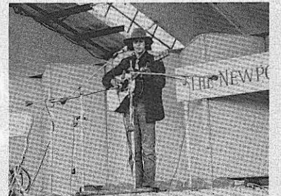
Arlo Guthrie, son of Woody Guthrie, tore fans up with "Alice's Restaurant" tune.