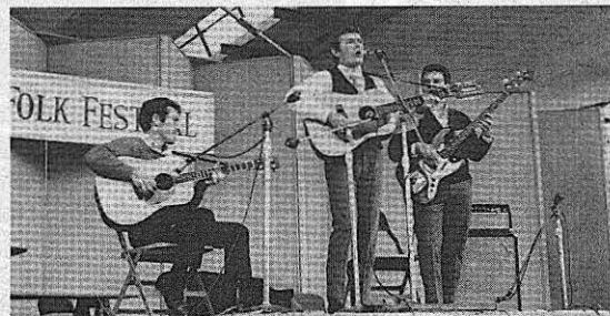
Gordon Lightfoot does "Early Morning Rain" for enthusiastic fans.