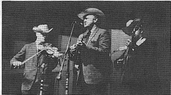
Bill Monroe, father of bluegrass, doing the original version of "Blue Moon of Kentucky."