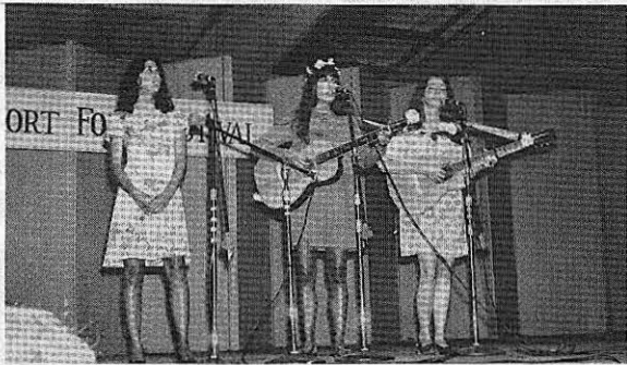
On Saturday night, the females teamed up. From left: Joan Baez, Mimi Farina and Judy Collins.