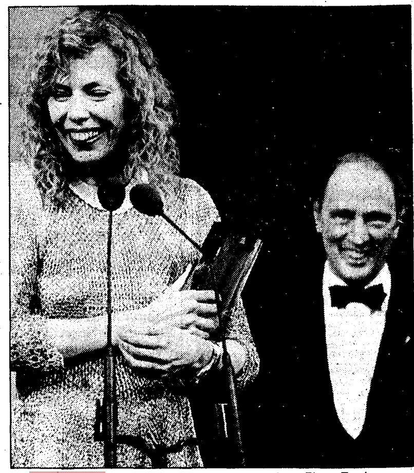
Joni Mitchell received place in Hall of Fame from Pierre Trudeau.