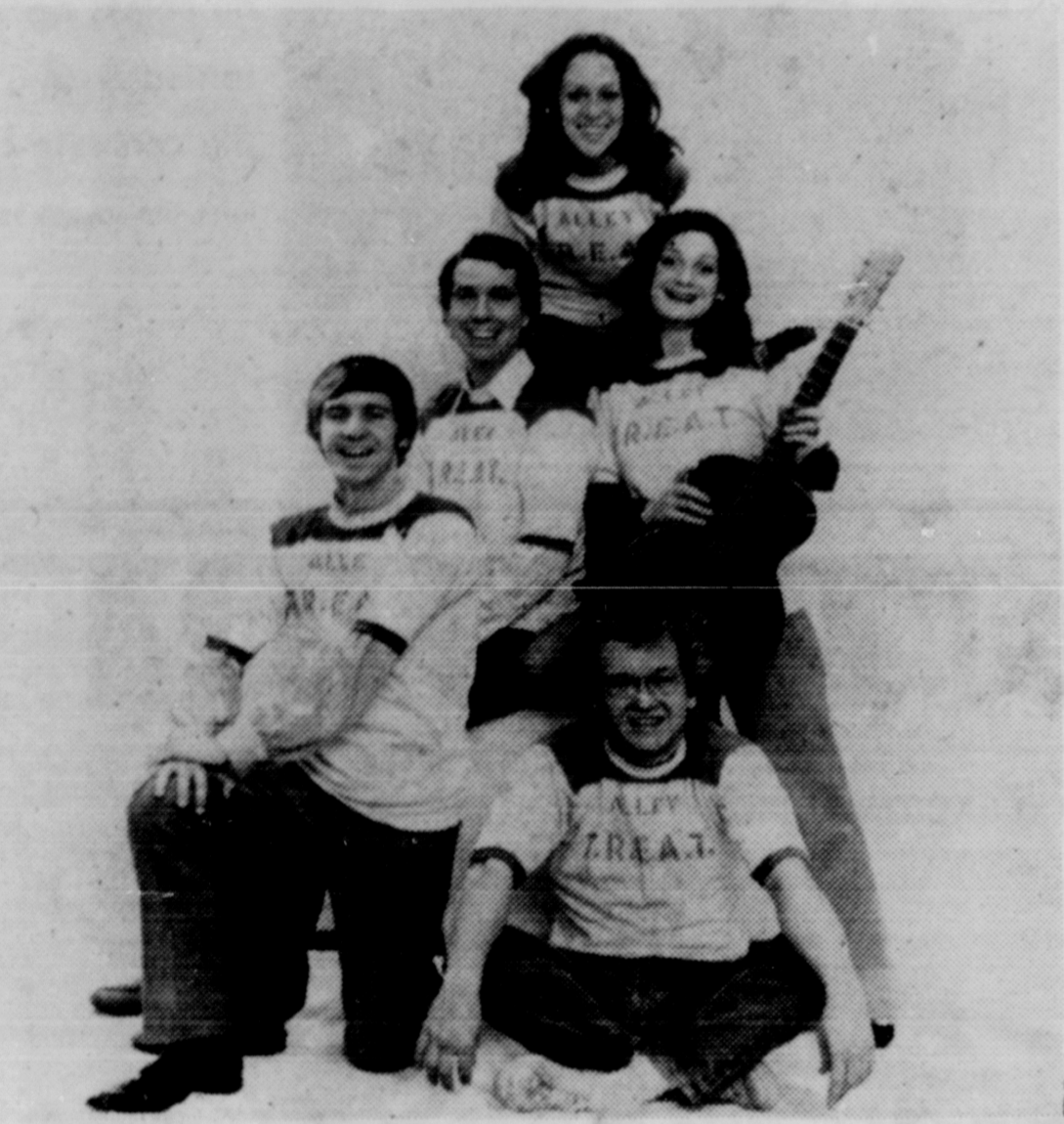
'YOU AND U.S.,' a series of performances and readings from American literature, will be presented by the Alley Theatre's Treat program at 1 p.m. today in the World Affairs Lounge of the UC.