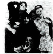
DANCE HALL CRASHERS