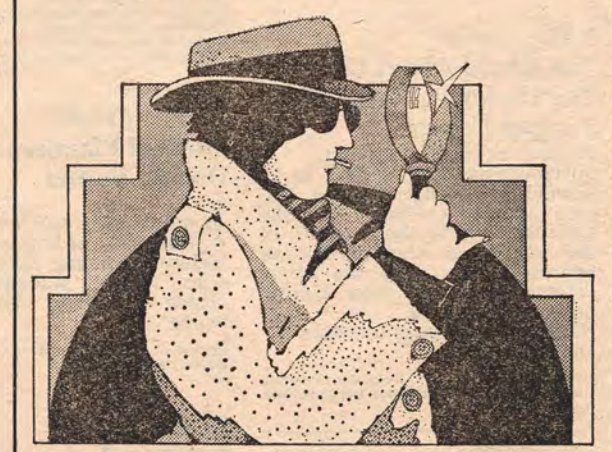
Michael Sadler's play The Bull of La Plata: 7.30 pm